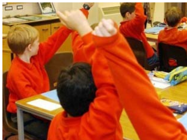
Formal school learning should begin at the age of six, according to a new review

Schools Minister Vernon Coaker has rejected proposals for children to begin formal education at the age of six.