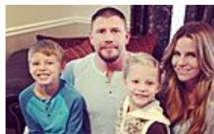
US cop killed family after British wife confronted him about rape 09 Jul 2014