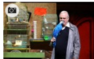
Monty Python Live (Mostly): in pictures