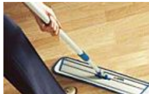
How To: Clean hardwood floors without damaging them Shaw Floors