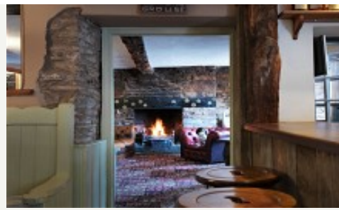
Farm fresh: right recipe for triumphing against the odds