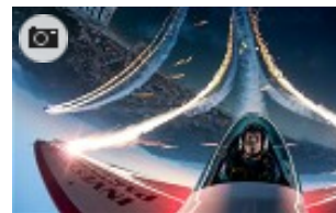
On a wing and a flare