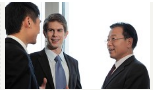
Five steps towards becoming an export business