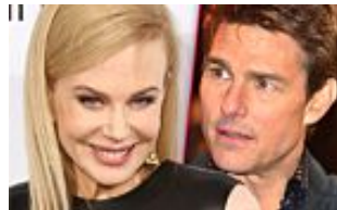
Nicole Kidman Finally Speaks Out About Misery of First Marriage RadarOnline.com