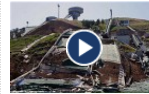
£19m ski jump collapses in Turkey