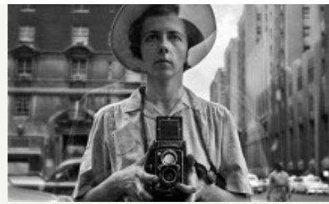
Watch the trailer for the critically acclaimed documentary film