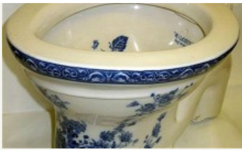
A toilet, a tooth, it's the world's weirdest auction lots