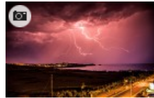
Lightning storm in pictures