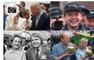
William Hague in pictures