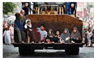
Gaza conflict: Palestinian death toll soars as Israel pounds north 20 Jul 2014