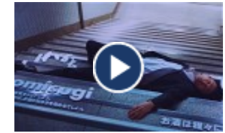
Japanese bar uses sleeping drunks as billboards