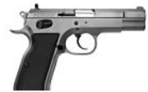
States With the Most Gun Violence USA TODAY