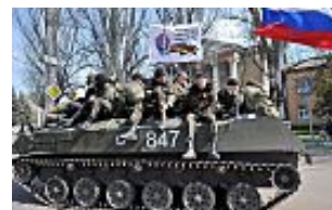
Russia vastly outgunned in economic showdown with West 21 Jul 2014