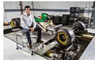
The vital F1 job you never see on TV Tech Page One