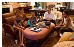
Barack Obama's 10 favourite TV shows 22 Jul 2014