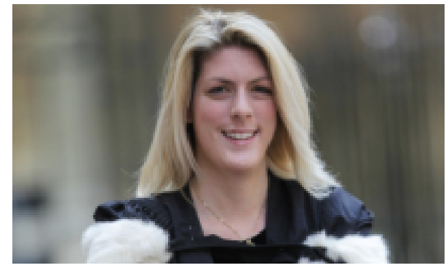
First among unequals at Cambridge