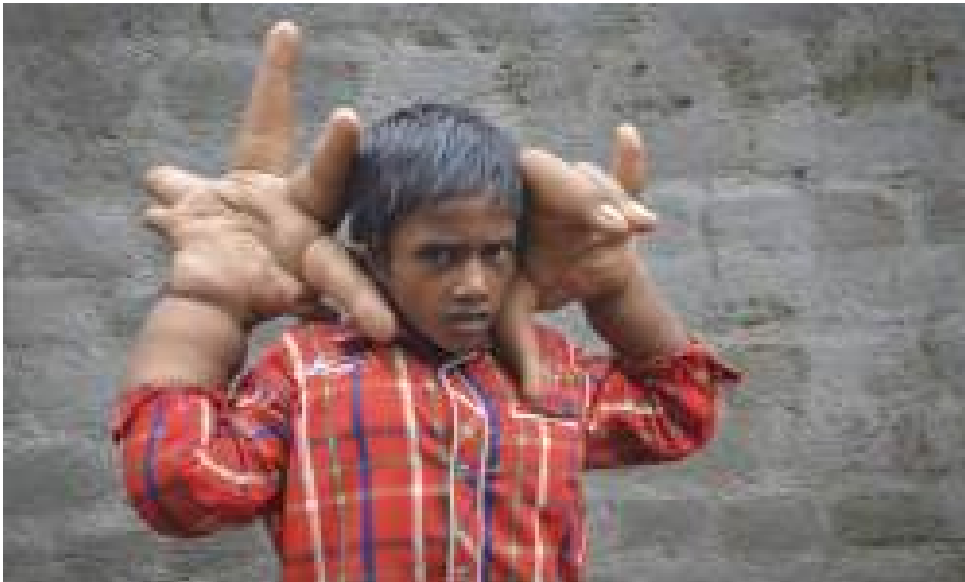
Boy with giant hands shunned after they grew bigger than his