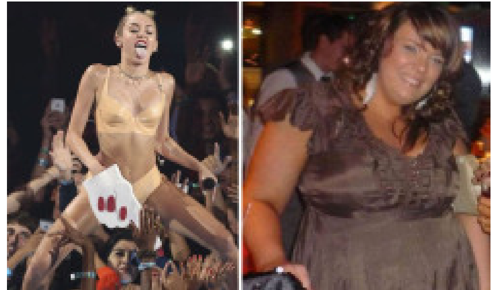
This bride-to-be lost six stone by TWERKING