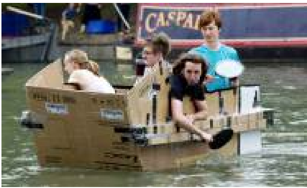
Cambridge students take to the water in cardboard boats