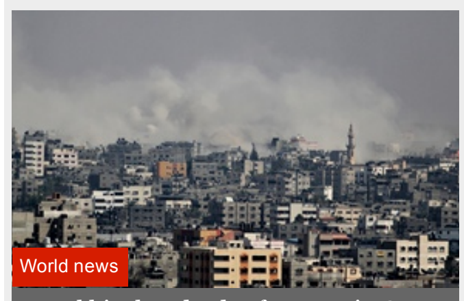
Israel hits hundreds of targets in Gaza as soldier is confirmed missing