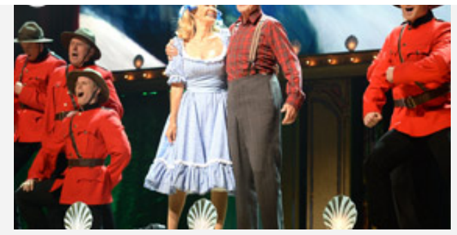
This comedy troupe has ceased to be ... The five surviving members of Monty Python bid farewell in their final show at London's O2 Arena