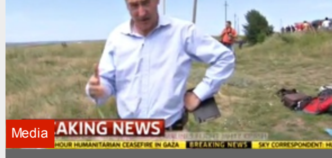
MH17: my error of judgment, by Sky News reporter