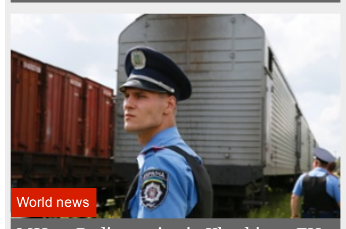
MH17: Bodies arrive in Kharkiv as EU discusses new sanctions – live updates