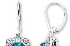
Kay Jewelers Blue Topaz Earrings 1/3...