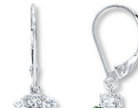
Kay Jewelers Lab-Created Emerald...