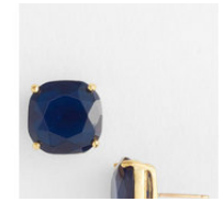
Kate Spade New York Faceted Square...