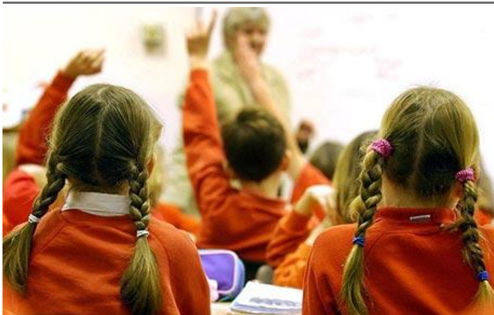
The Cambridge Primary Review called for SATs to be replaced by a system of less formal

Sats tests for 11-year-olds should be scrapped, according to the Cambridge Primary Review.