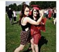
This Awesome Mom Went to Graduation Wearing the Dress Her Daughter's...