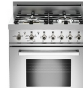
Bertazzoni PRO244GASXLP Pro...