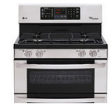
LG LDG3031ST Stainless Steel 30...