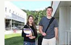
Top 10 community colleges in the US (Bankrate)