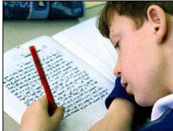
The Sats tests chaos became the biggest education story