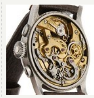
Time to bid? A guide to buying watches at auction