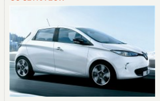
Picture gallery: five of the best options for ultra low emission vehicles