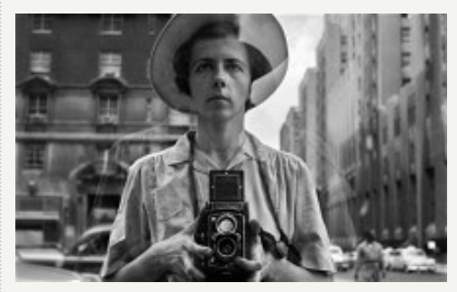
Watch the trailer for the critically acclaimed documentary film