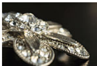
It's not Junk: The Most Overlooked Garage Sale Items You Should Buy (Reader's Digest)