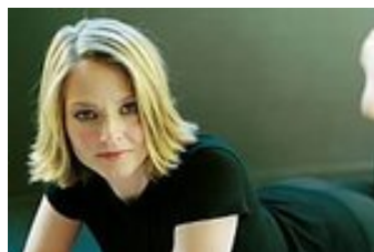
17 Gay Celebs Who Pretend to be Straight