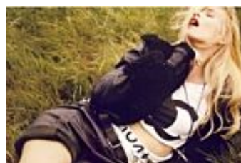
10 Tips on How to Experience Mind Blowing Quickies ... (Binoni)