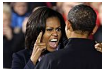
The Queen Of Mean: 15 Times Michelle Obama