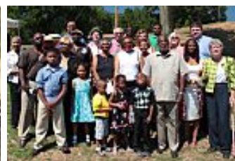
Michelle Obama's mixed race heritage proved by DNA.