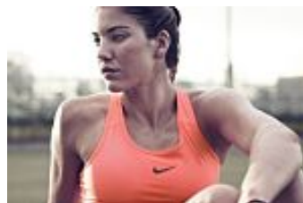
7 Hottest Female Athletes Who Will Give